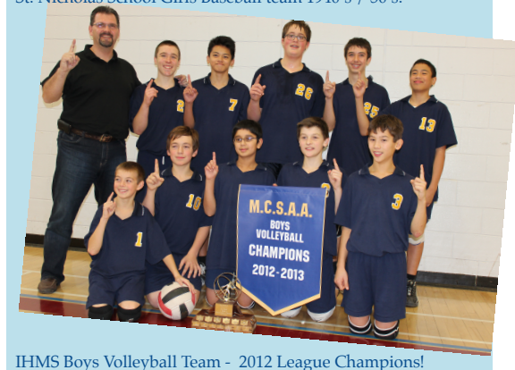
IHMS Boys Volleyball Team - 2012 League Champions!

For over 100 years the school has been providing students an opportunity to develop their athletic skills. Pictured to the left is a St. Nicholas School Girls Baseball Team from the late 1940's early 1950's. Currently, the school's sports teams have just completed a highly successful volleyball season and are now charging ahead in basketball. IHMS fields both competitive and developmental teams to provide all interested students with a chance to participate. This past fall, the IHMS Boys Volleyball Team won the League Championship, and as well the St. Paul's High School Invitational Volleyball tournament, and came 5 th in the provincial playoffs. The Girls Volleyball Team did very well also, finishing third in their league overall. IHMS competes in city-wide league play for volleyball, basketball, badminton and track & field.