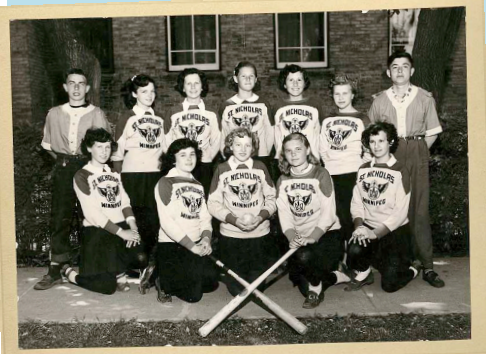
St. Nicholas School Girls Baseball team 1940's / 50's.