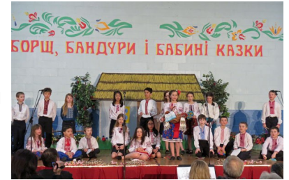
Borscht, Banduras and Baba's Stories

There certainly have been many marvelous, recent, events at the school, that the current students will treasure and learn from. Always a highlight of the school year is Ukrainian Week at IHMS. During this time of wonderful learning opportunities, the students truly experience the rich Ukrainian culture through language, music, song, dance, costume and even delicious cuisine (with a perogy lunch)! An entertaining concert entitled 'Borscht, Banduras and Baba's Stories' was performed to capacity crowds as part of the week's festivities. Throughout the show the young performers truly sang and danced their way into the hearts of everyone in the audience. Applause, laughter and tears of joy were clear signs everyone was delighted and amused by the performance.