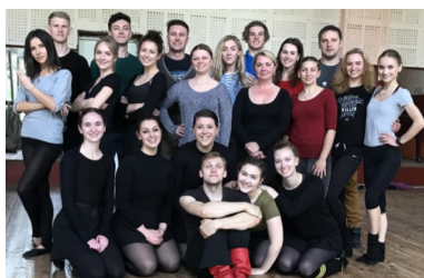
With the Volyn State Dancers

Every city and ensemble has been so different, with unique experiences in both dancing and everyday life, that it's impossible to choose a favourite. One of numerous dance highlights is performing with the Bukovyna State Ensemble in Chernivtsi. During our first couple rehearsals with the ensemble, we learned the dance Chervona Kalyna , and had the opportunity to perform it twice the following week. The ensemble was beyond encouraging during preparations and remarkably congratulatory on our debut performance. Dancing in a beautiful theatre in Ukraine while surrounded by a live choir and orchestra – and the emotions that went with it – made for an unforgettable experience.