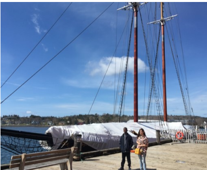
Brooke Buchan and Donovan Martin in Halifax

Other amazing opportunities for IHMS students these past few months have included: