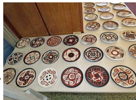
Tripillian Clay Plates by the Grade 8 Class