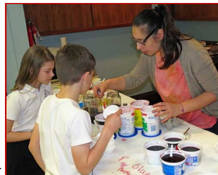
Writing Pysanky Using Natural Dyes

The first session of the program took place in October, where students learned how to make natural dyes. In March, students used the natural dyes they made to write pysanky for Easter. Overall this was a wonderful learning experience for the students, especially learning a new way to approach a Ukrainian tradition.