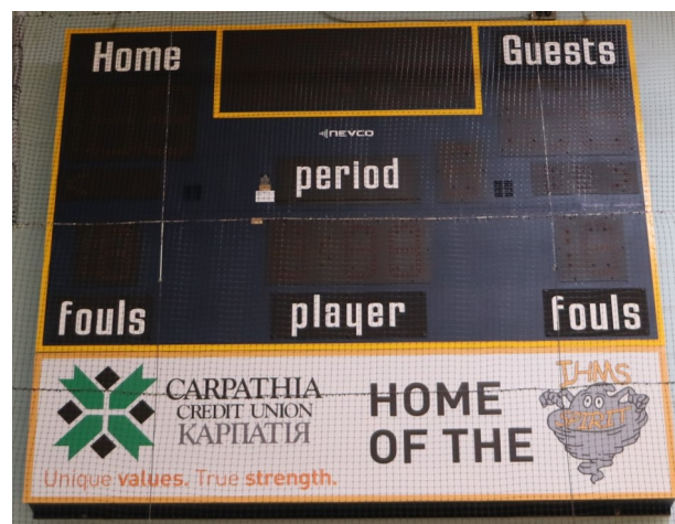
The New IHMS Scoreboard

An important space for daily school life, the gym is certainly a hub of activity. Immaculate Heart of Mary School is proud to showcase this new scoreboard in the gym!