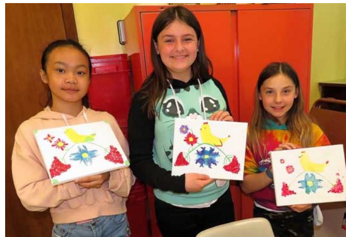
Students proud to showcase their cultural art!