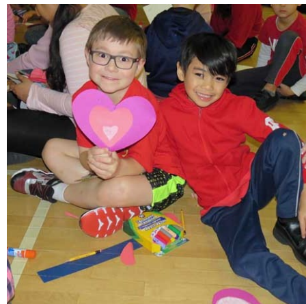
Students working on Valentine cards for the residents of Holy Family Home

This year Valentine's Day fell during Catholic Schools Week—an annual event to build on the appreciation of the educational achievements and spiritual benefits of attending a Catholic school.