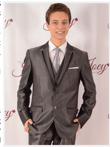
On the Red Carpet at the Joey Awards

I know that time will show what adventures await me next, and that fate will continue to bring together the students of IHMS during each of their adventurous lives.