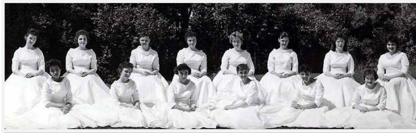
Immaculate Heart of Mary Academy Graduation - 1959