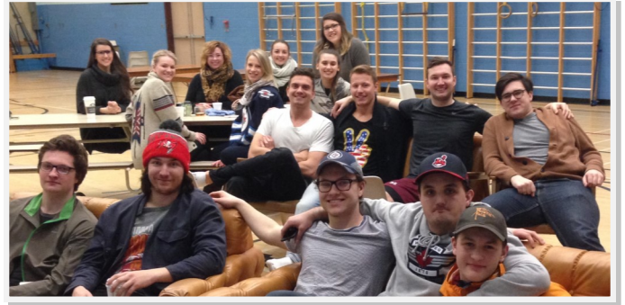
2nd Annual Alumni Hockey Night