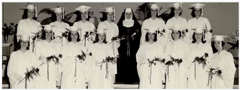
The last grade 12 graduation - class of 1956