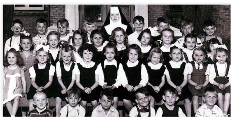
St Nicholas School Grade 1 & 2 1950 - 51