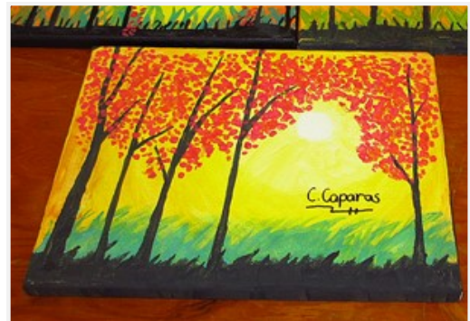
The scene grade 7 students learned to paint

Each grade received instruction in acrylic painting, completing a painting that was displayed before they took them home.