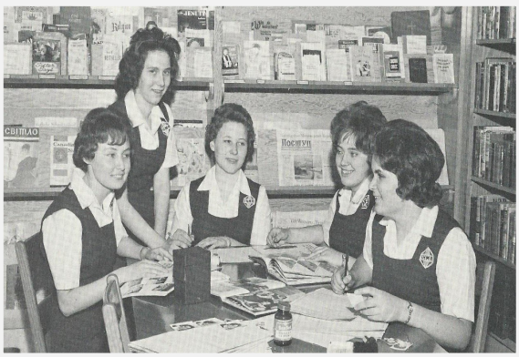
Immaculate Heart of Mary School Academy Yearbook Executive 1961-62

Just after I started at IHMA in September 1960, my Father died suddenly, and my Mother became a widow with three children. How it was decided, I don’t recall, but I moved into residence at IHMA, and in my year and a half there, I learned much about independence while living in a community, and doing household chores on a large scale.