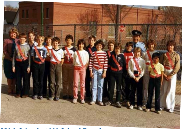
I.H.M. School - 1983 School Patrols.