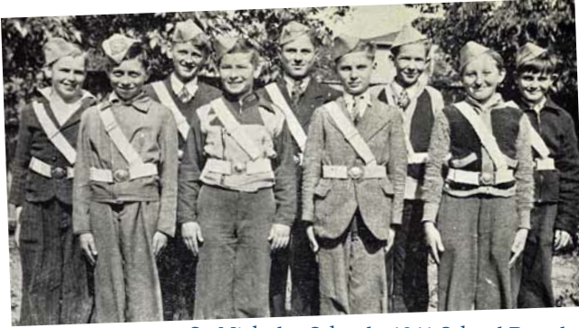
St. Nicholas School - 1941 School Patrols.