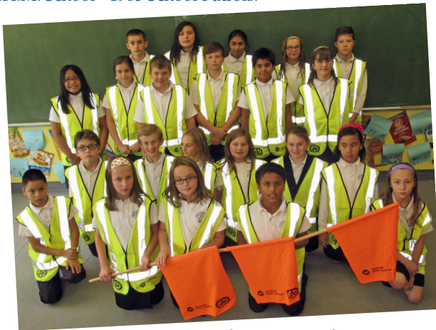
I.H.M. School - 2014 School Patrols.

Immaculate Heart of Mary School has been running a School Safety Patrol Program for over 70 years. Keeping children safe has always been their goal. Whether it be assisting children as they cross the street ... or lending a helping hand during a recess break in the school corridors ... the Safety patrols have always been an integral part of school life.